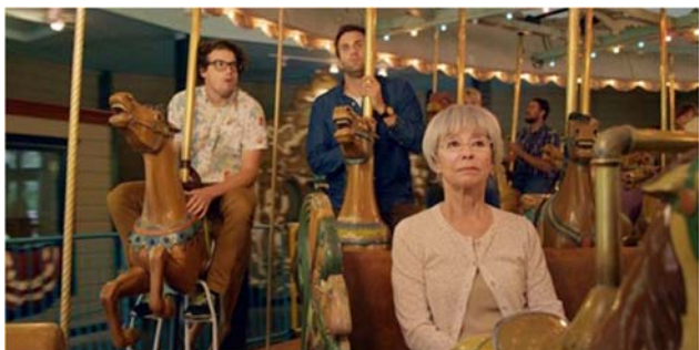
Rita Moreno in "Remember Me".

September 16-18 New People Cinema, 1746 Post Street, Japantown, San Francisco.