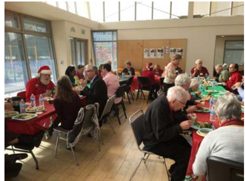
Soup's on! Villagers and volunteers sharing some holiday cheer.

NEXT Village wrapped up 2015 with a special Holiday Potluck, warm soup, fresh bread, and some good games. Thanks to our special volunteers for donating their time and the food, and to those of you who joined us for what we hope will be an annual event.